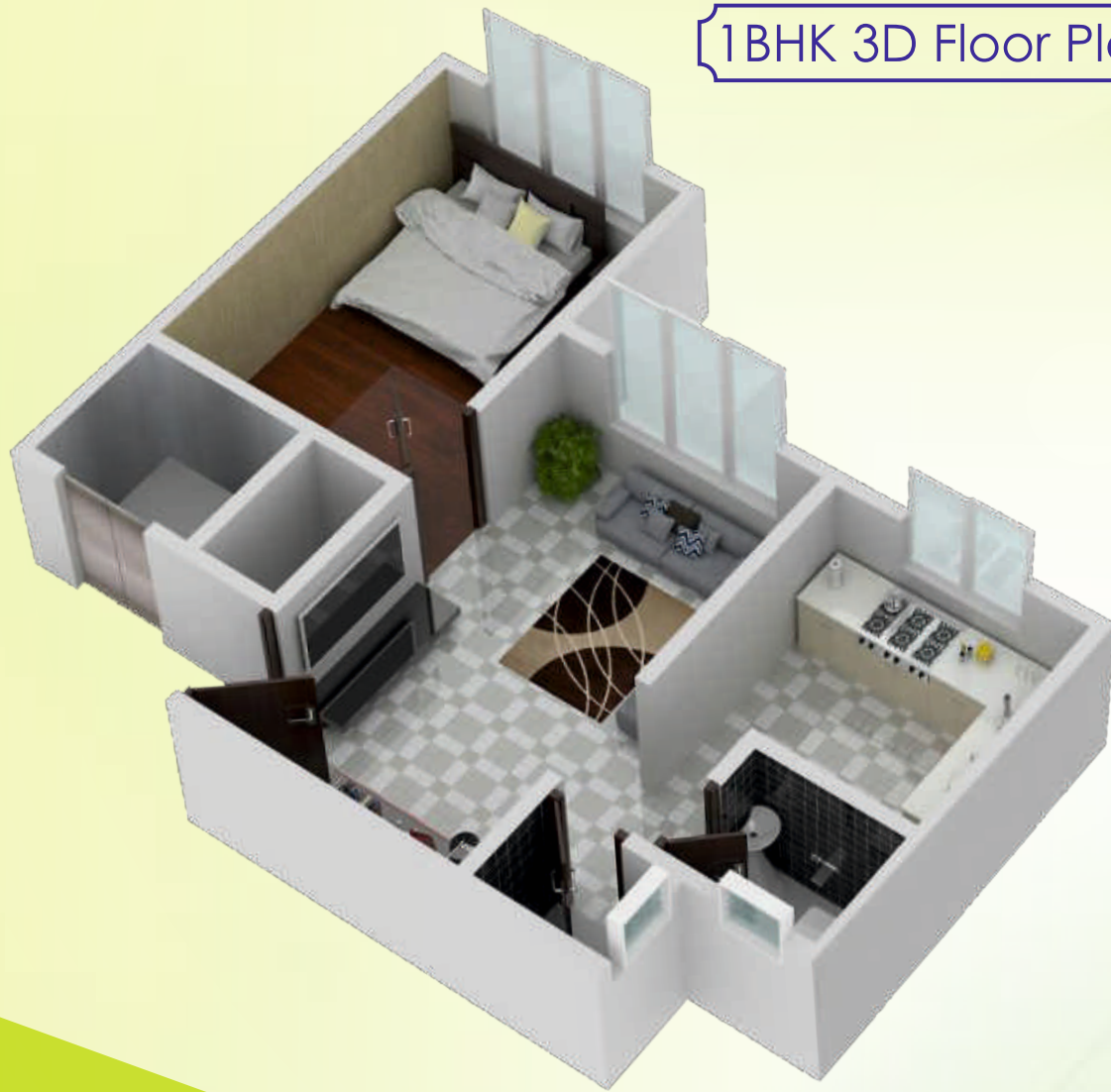
1BHK 3D Floor Plan