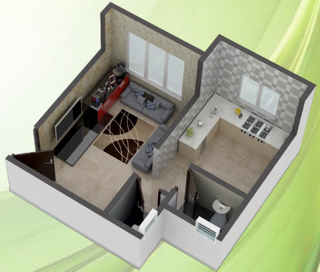
1RK 3D Floor Plan