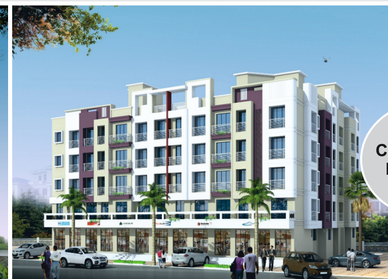
AWADH APARTMENT, BOISAR (E)