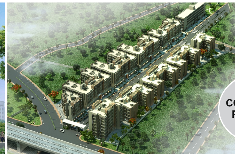
G. M. THAKUR CITY, BOISAR (E)