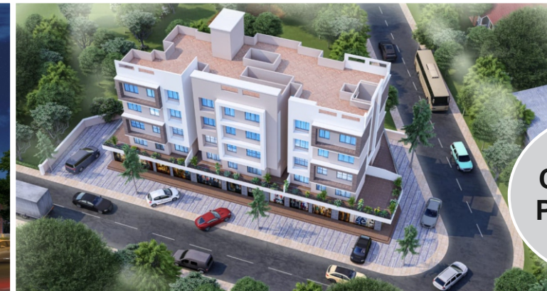
RIYANSH ENCLAVE, UMROLI (W)