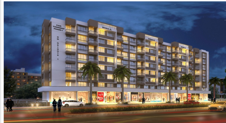
FAIR TOWNSHIP, PALGHAR (W)

Our core ideals revolve around trust, high quality work and timely possession.