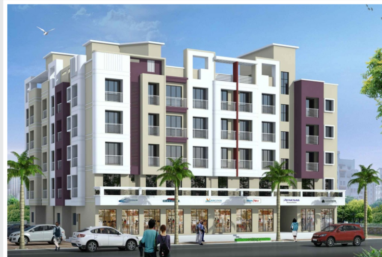
RADHA RESIDENCY, BOISAR (E)