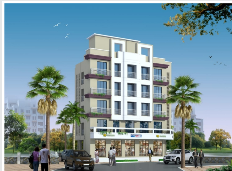
SUBINNY APARTMENT, BOISAR (E)